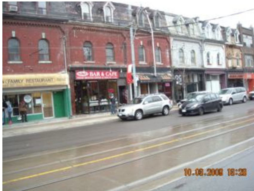
Figure 3 “Local Restaurants.”