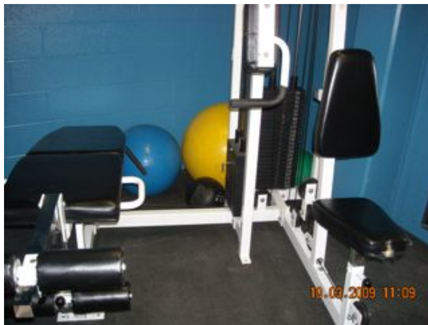
Figure 6 “Gym.”

It's a small room, yeah. They don't have room to, to have six or seven people same time. If they come in five person, you have to wait until they finish and then come back again to exercise your stuff. (Eric)