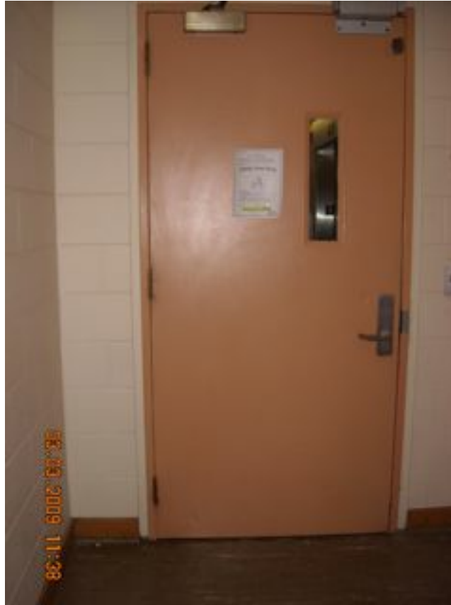
Figure 7 “Locked Door.”

activities that aligned with their specific interests programmed for them in order to increase their levels of physical activity.