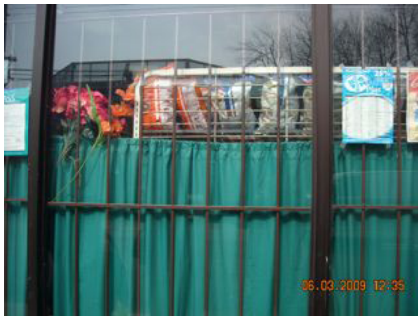
Figure 4 “Local Convenience Store.”

A few participants also mentioned that clients lacked the necessary budgeting skills to purchase groceries adequately. A recommendation from one participant was to offer clients information on how to budget accordingly in order to purchase more healthful food products.